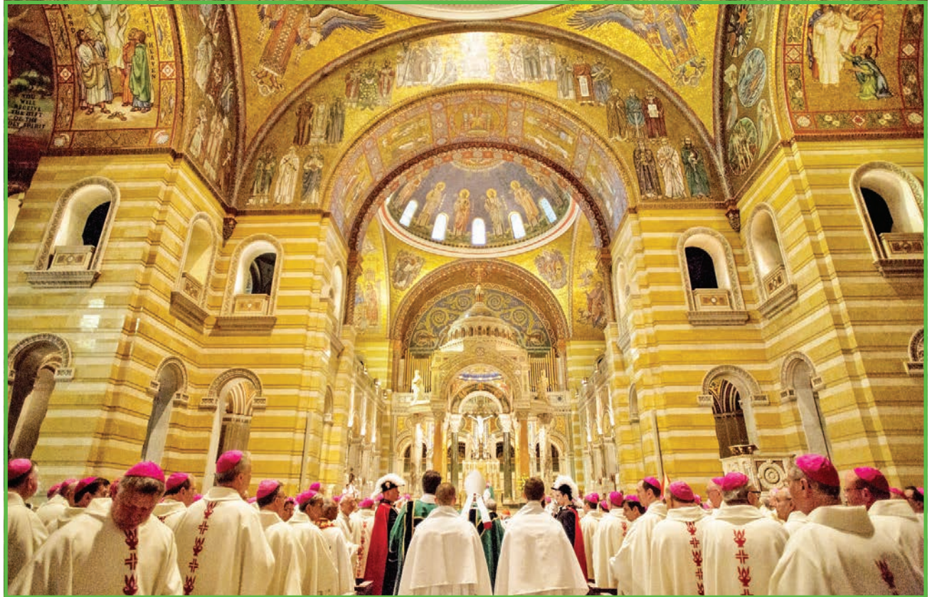
Bishops gather for Mass on June 10 at Cathedral Basilica of St. Louis during the spring 2015 general assembly of the U.S. Conference of Catholic Bishops.

While there, light a candle at one of the most beautiful cathedrals in the country, the Cathedral Basilica of St. Louis, which is the resting place of Cardinal Joseph E. Ritter, a native of New Albany and former archbishop of Indianapolis.