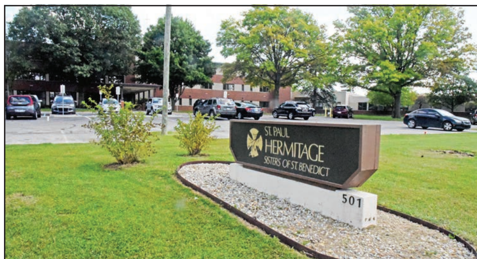
The Sisters of St. Benedict of Our Lady of Grace Monastery in Beech Grove announced on Sept. 15 the sale of their St. Paul Hermitage retirement and nursing care facility to Green Tree Healthcare.

“While we are saddened to be moving on from this ministry, our work in other areas of the community, such as education, nursing, social services,