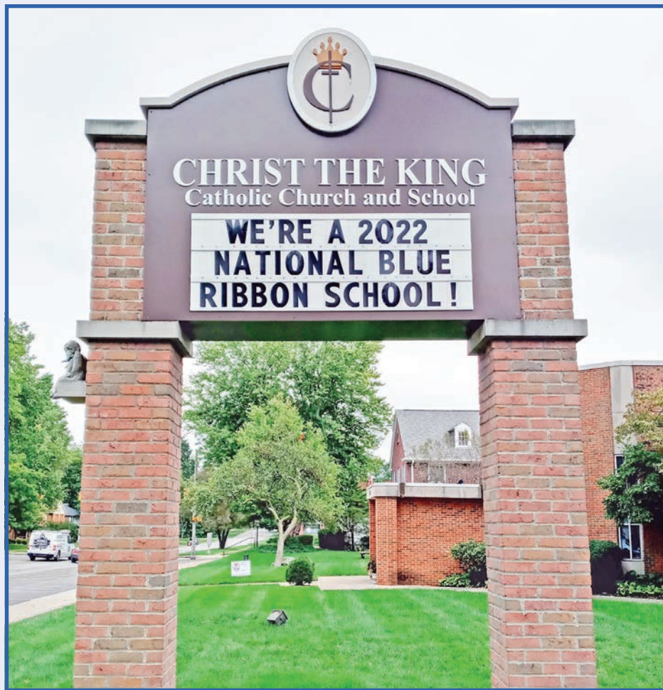
The signboard for Christ the King Parish and School in Indianapolis proclaims the news that the school was chosen as a 2022 National Blue Ribbon School.

“Blue Ribbon Schools have gone above and beyond to keep students healthy and safe while meeting their academic, social, emotional and mental health needs. These schools show what is possible to make an enduring, positive difference in students’ lives.” †