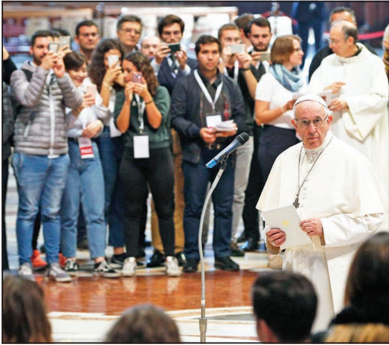
Pope Francis prepares to address young people who participated in a pilgrimage hike from the Monte Mario nature reserve in Rome to St. Peter's Basilica at the Vatican on Oct. 25, 2018, during the Synod of Bishops on young people, the faith and vocational discernment.