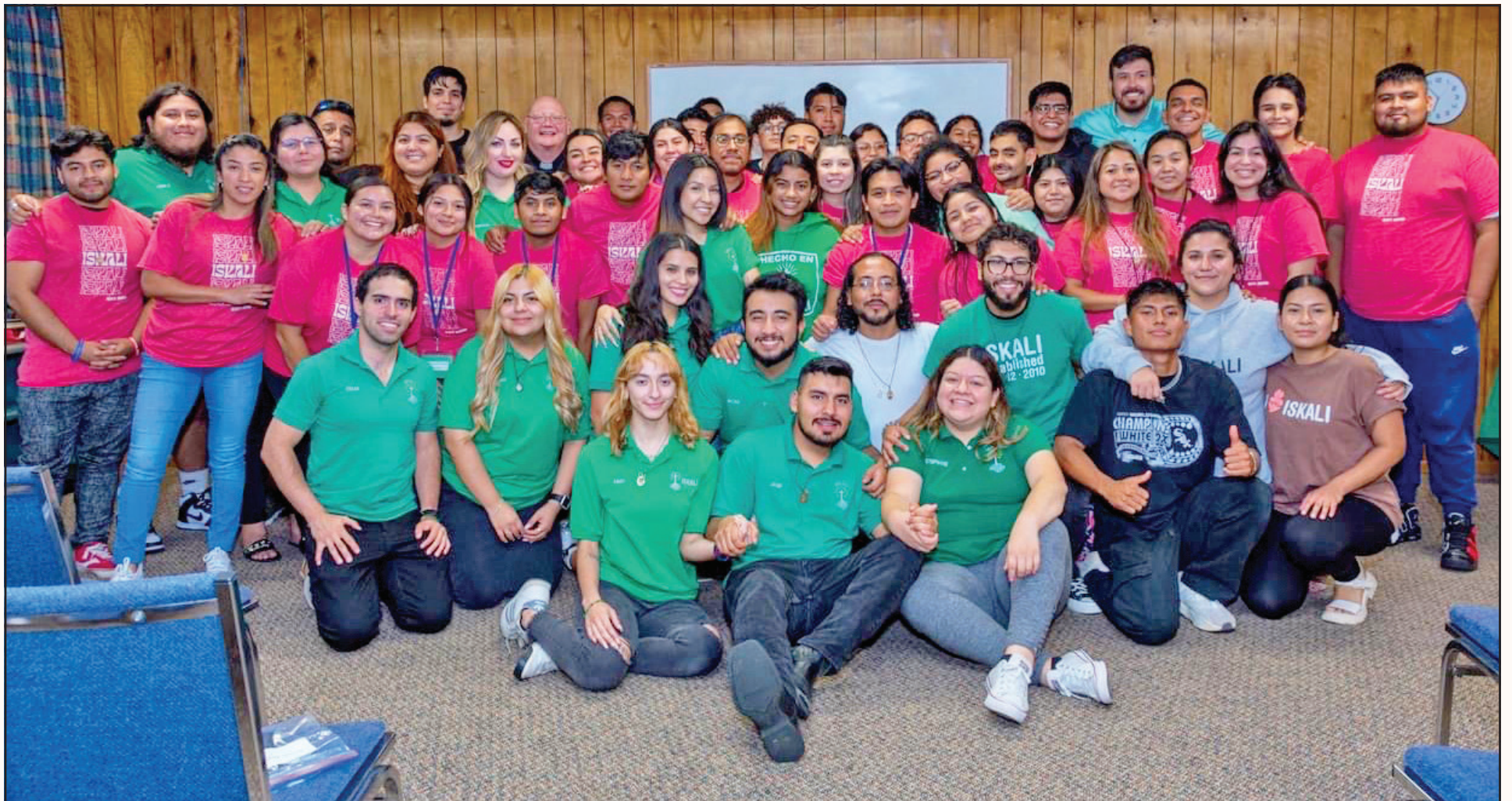
Los participantes que asistieron al retiro Iskali el 28 de agosto en el Benedict Inn Retreat and Conference Center de Beech Grove.