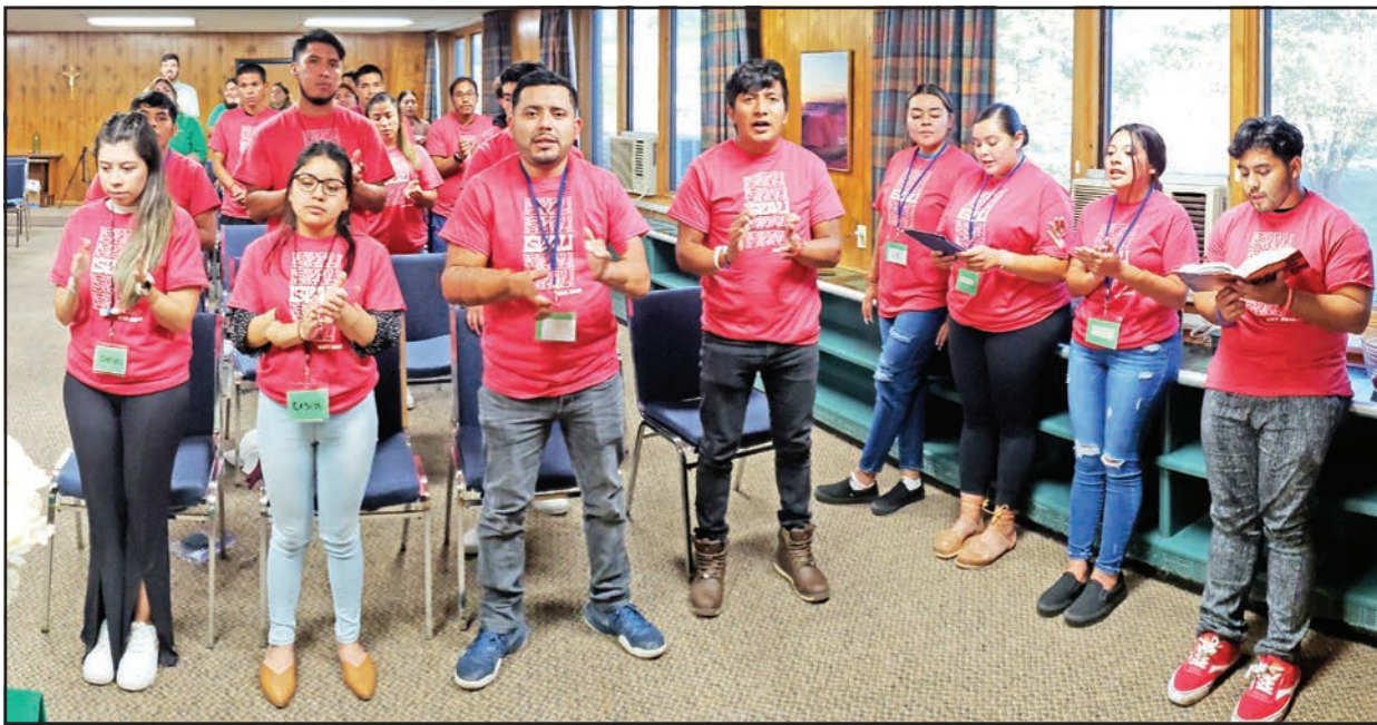
Participants at the Iskali retreat clap as they sing the recessional hymn after the retreat’s closing Mass on Aug. 28 at the Benedict Inn Retreat and Conference Center in Beech Grove.

can exist in a parish if more than 15 people are interested.