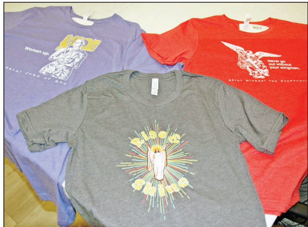
Expanding beyond socks, Sock Religious also creates T-shirts with touches of saintliness and whimsy.

"When I go to my high school reunion, people ask what I'm doing. I say, 'I own the world's largest Catholic sock company.' You have to explain to people this is a viable business, and it's doing good things in the Church. The things we are doing are fun, joyful, innovative, exciting. Is it a little goofy? Yeah, but so are we." †