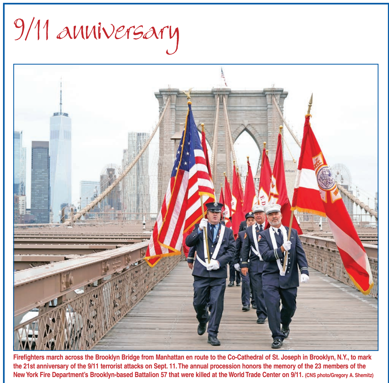
Firefighters march across the Brooklyn Bridge from Manhattan en route to the Co-Cathedral of St. Joseph in Brooklyn, N.Y., to mark the 21st anniversary of the 9/11 terrorist attacks on Sept. 11. The annual procession honors the memory of the 23 members of the New York Fire Department's Brooklyn-based Battalion 57 that were killed at the World Trade Center on 9/11.