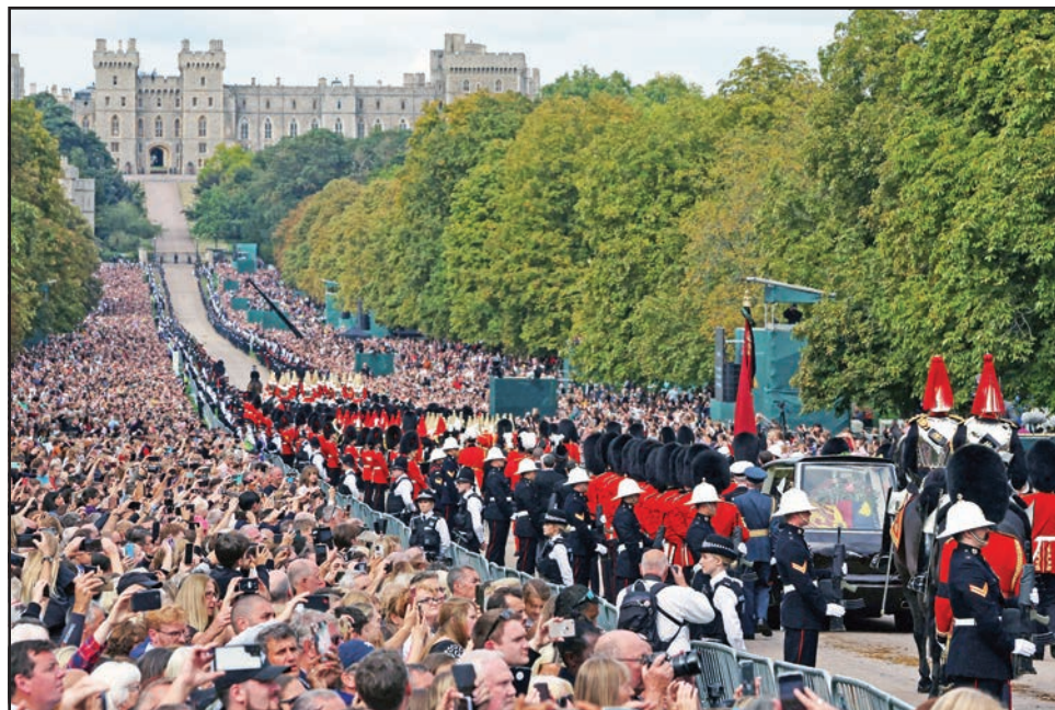
The hearse carrying the casket of Britain’s Queen Elizabeth II is escorted along the Long Walk toward Windsor Castle toward her burial on Sept. 19.

After the service the coffin was driven to Windsor Castle, where the queen was interred in St. George’s Chapel. †