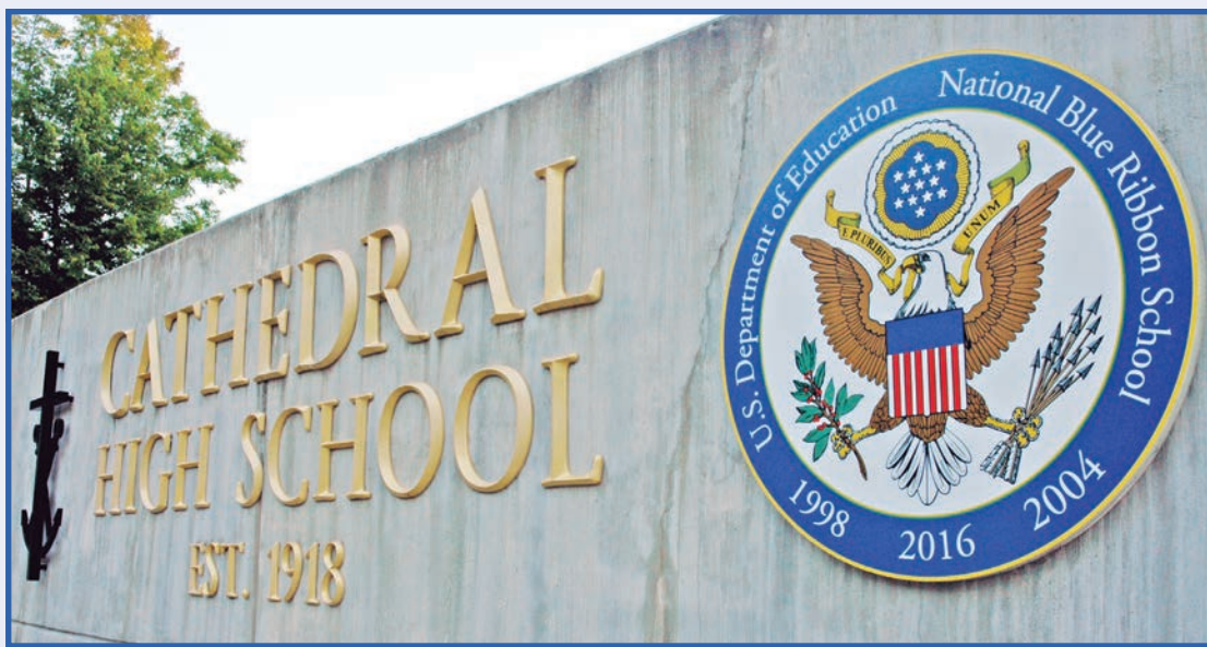
Cathedral High School in Indianapolis will have to add a new National Blue Ribbon School sign as the private Catholic school recently earned its fourth such honor from the U.S. Department of Education.