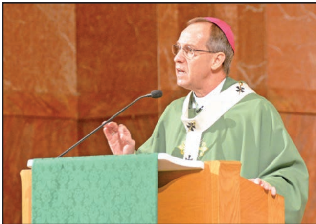
Archbishop Charles C. Thompson delivers a homily during the archdiocese's Annual Respect Life Sunday Mass on Oct. 6, 2019.